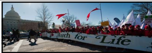
Thurs., 1/22/2015 - See Front Page

NON PROFIT ORG. U.S. POSTAGE PAID HICKSVILLE, NY 11801 PERMIT NO. 263