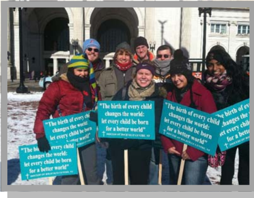
Students from Stony Brook University's Catholic Campus Ministry at the 2014 March for Life in Washington, D.C.

Hazardous driving conditions in Nassau and Suffolk forced cancelation of all buses scheduled to leave on Wed. 1/22 to attend the March for Life. Several student groups left a day or so earlier and participated in the